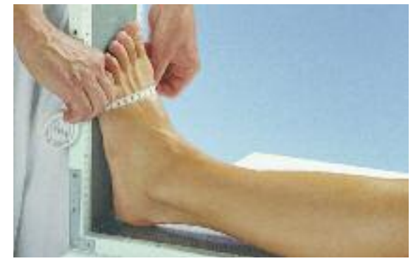
Take circumferential measurement A at the metatarsophalangeal joint.