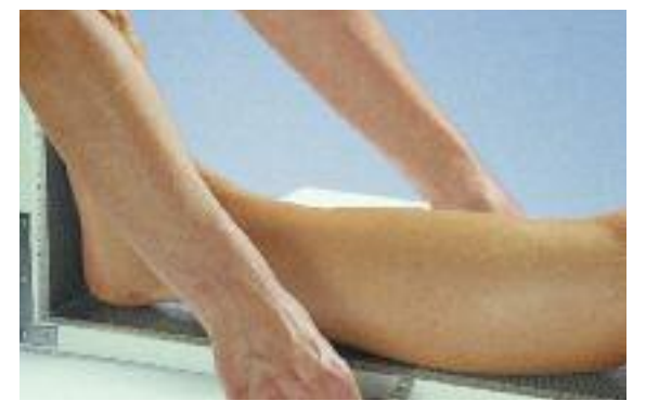
Measure circumference C and length a-C at the greatest calf circumference.