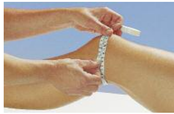
Circumference E is the knee circumference; measure at the middle of the patella, with the leg slightly angled.