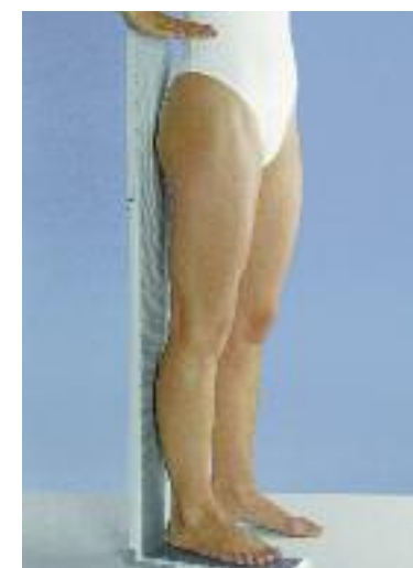
Measure length a-T on the outside as far as the waist, reading off directly from the measuring board. The customer determines the waist height herself with her hand.