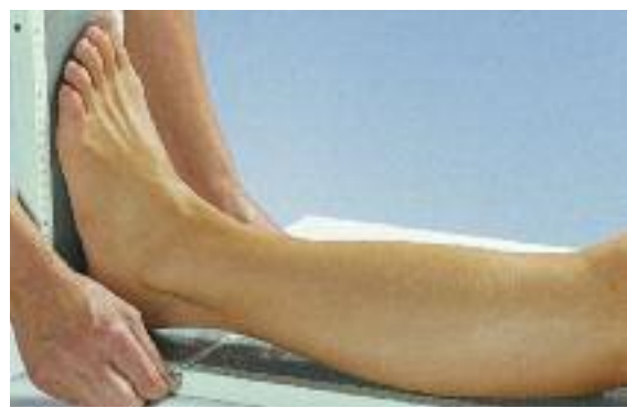
Measure circumference B and length a-B above the ankle at the narrowest point of the calf.