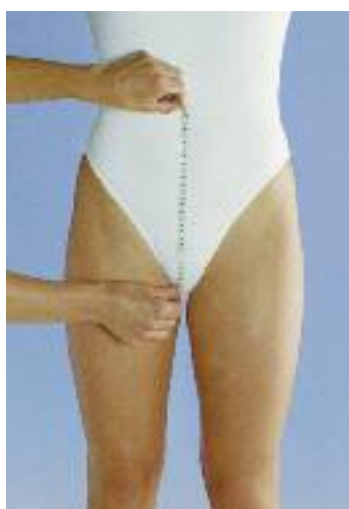
Measure the length of the panty at the front ( K1-T ) from the waist to the crotch.