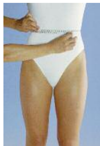
Measure circumference T at the waist.