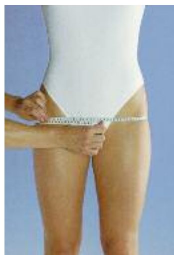
Measure circumference H at the level of the greatest circumference around the hips.