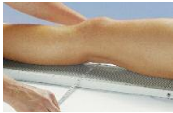
Measure length a-E to the middle of the kneecap with the leg extended.