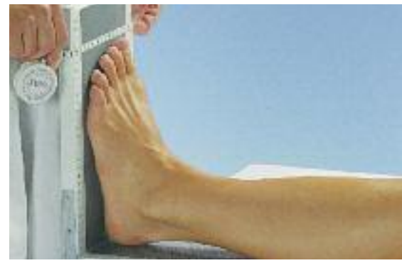
Foot length without tip: from the metatarsophalangeal joint to the end of the heel. Foot length with tip: from the tips of the toes to the end of the heel.