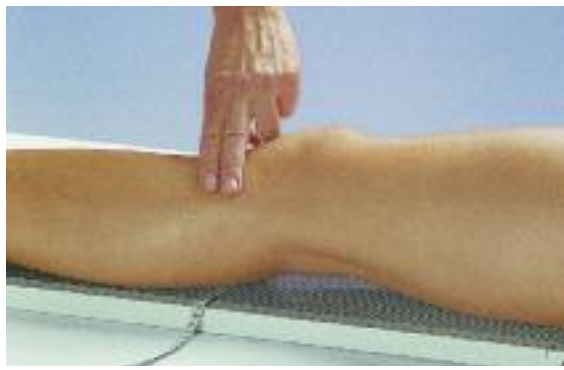
Measure circumference D and length a-D at the fibular head (two finger widths below the kneecap).