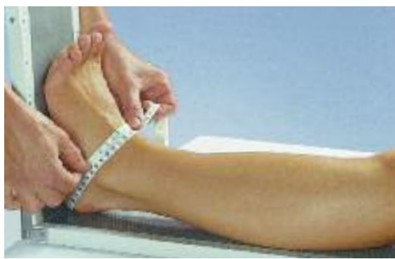
Take circumferential measurement Y around the instep and heel at maximal dorsiflexion.