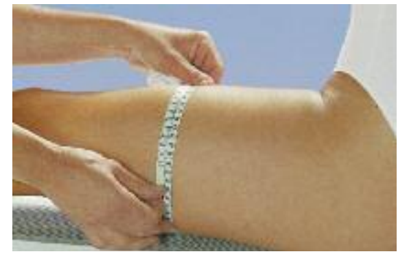
Measure circumference F and length a-F at the middle of the thigh.