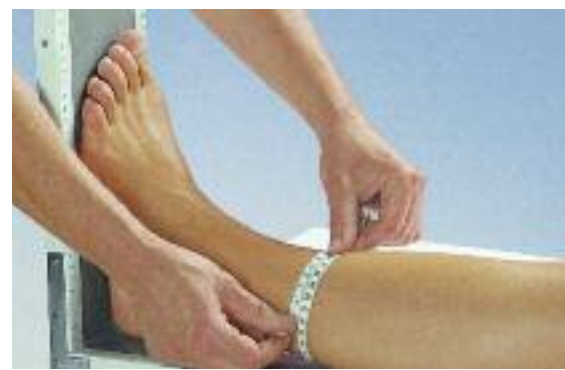
Measure circumference B1 and length a-B1 at the Achilles tendon / calf transition.