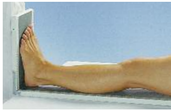
Place the measuring board on a stable surface, place the tape measure, ballpoint pen and size order card in readiness; have the patient place her leg on the measuring board.

Note: The leg should be largely free of edema before measuring for a stocking. The degree of edema can be checked by pushing firmly with the finger. If edema is present, pitting is observed which does not immediately disappear. If this is the case, the patient is not ready to be measured for compression stockings.