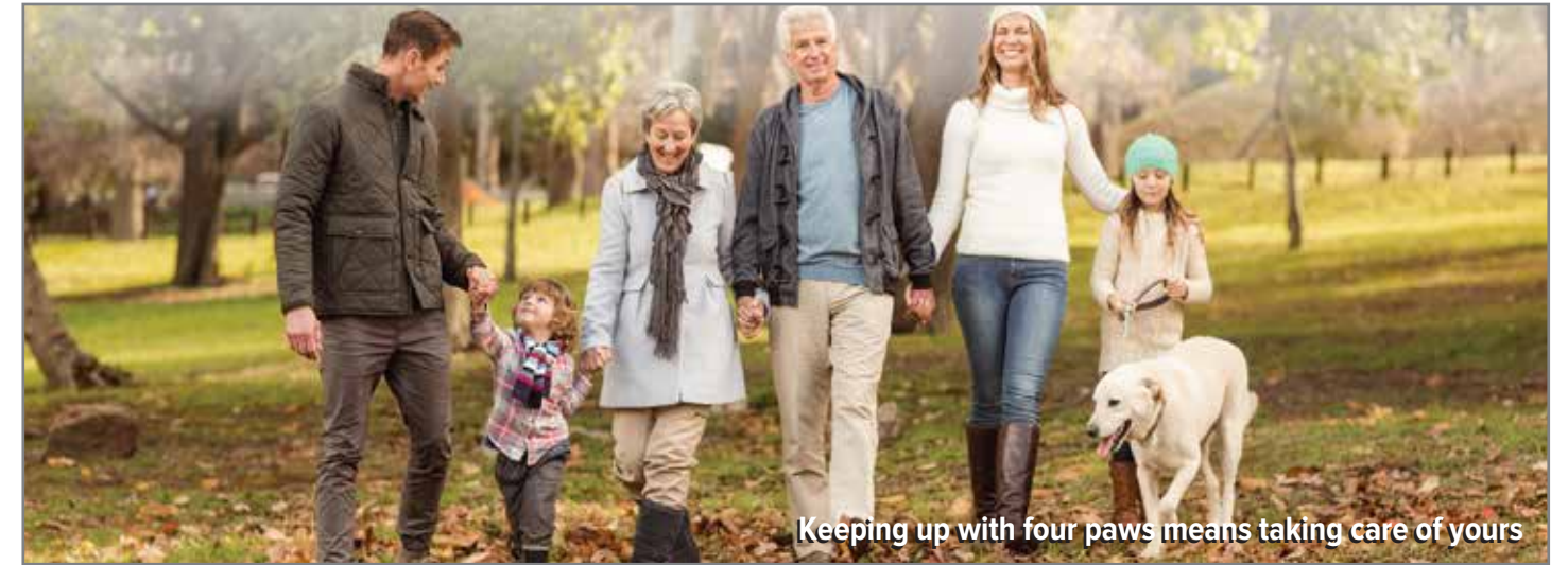
Keeping up with four paws means taking care of yours