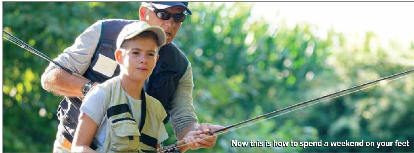
Now this is how to spend a weekend on your feet