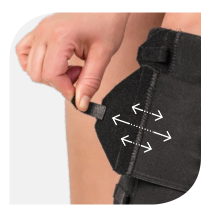
Durable straps and easy-to-use donning tabs

TributeWrap is an off-the-shelf adjustable foam garment for lymphedema or edema management during the evening, night or low activity. TributeWrap comfortably adjusts to your patients' unique shape and lifestyle to help maintain their gains made during therapy, while allowing the flexibility to support further reduction.